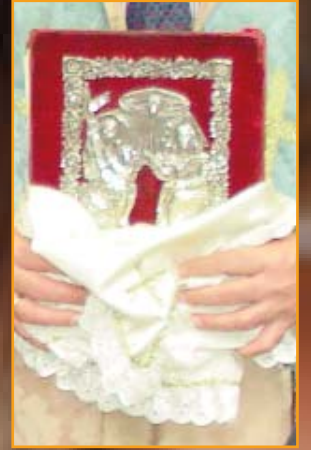
Text & design: Hratch Tchilingirian